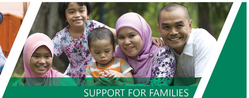
SUPPORT FOR FAMILIES

Dakota County Public Health Department 651.554.6100 www.dakotacounty.us